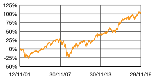
Architas MA Blended Intermediate - A Net Acc