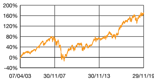
Architas MA Blended Growth - A Net Acc